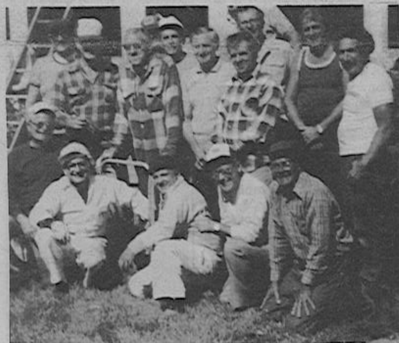
Members of Oatka Community Service Volunteers.

Oatka Lodge F&A.M. #759 was looking for a community project that would benefit someone in the Scottsville area this summer.