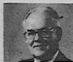
R. Kenneth Crawford Funeral Directors