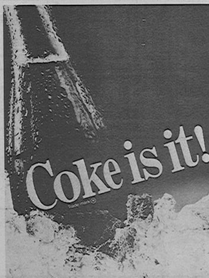
"Coke-Cola" and "Coke" are registered trademarks which identify the same product of The Coca-Cola Company. Rochester Coca-Cola Bottling, A.L. Anderson and Sons, Coca-Cola Park, 123 Upper Falls Blvd., Rochester, N.Y. 14605